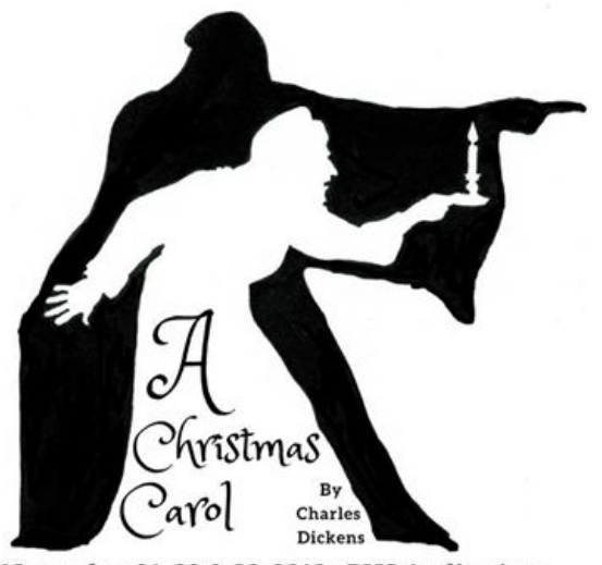
November 21, 22 & 23, 2019 - PHS Auditorium TICKETS: $10/ADULTS $8/STUDENTS & SENIORS Available Online: https://phsxmascarol.bpt.me

The Peekskill Education Foundation will be hosting a Wine Tasting and Silent Auction today, Saturday, November 16 from 3-6 PM at the Lincoln Depot Museum. Come stop by to show your support. The proceeds benefit our students!